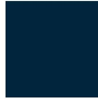
Polyethylene Mat blue navy