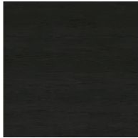
Veneered wood Coal oak