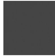
Painted metal Supreme anthracite