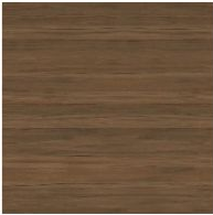
Veneered wood Walnut Canaletto