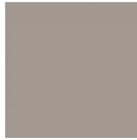
Painted metal Mat dove grey