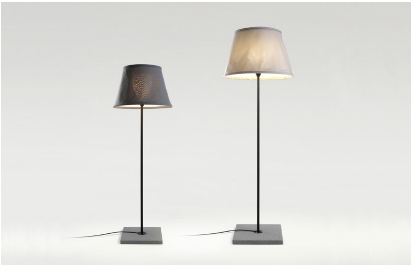
TXL 2019 205