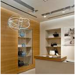
› Valextra Showroom