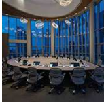
› Axa Headquarters