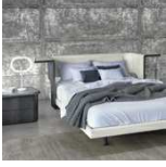
› Private Residence