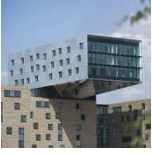
› Nhow Hotel