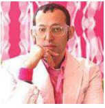
› Karim Rashid