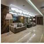
› MFC Capital City