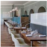
› Apex Hotel