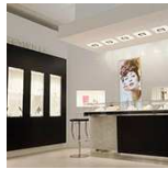
› FreyWille Moscow