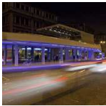
› ATM Bar