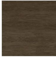
Solid wood Walnut painted ash