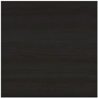
Solid wood Coal ash