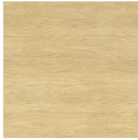
Solid wood Natural ash