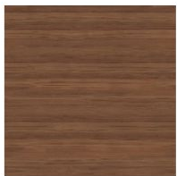
Solid wood American walnut

Materials, fabrics, leathers, colors and finishes are approximate and may slightly differ from actual ones. You can find the complete collection of Bonaldo fabrics and leathers on the website